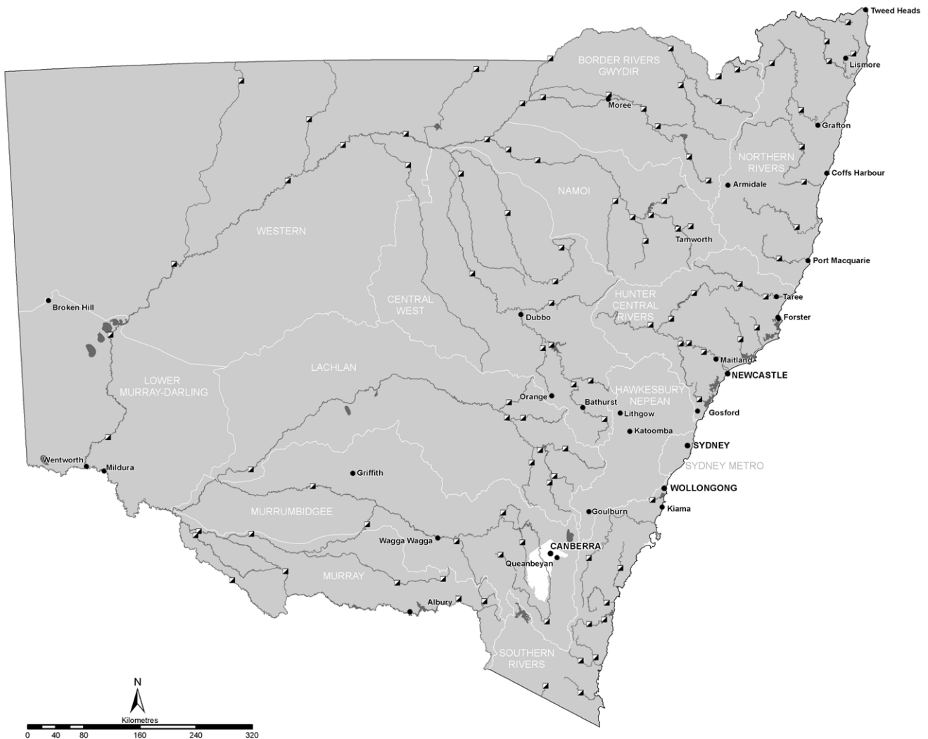
Figure 2 Map of NSW indicating CMA boundaries and location of water quality trend assessment sites (black and white squares)

To quantify the level of confidence in the archived data, a debit point system was developed to assess operational issues, excessive data gaps, site network issues, data collection issues and archival issues. The scoring system provided an objective approach to applying a low, medium or high confidence value to the data record. The data record was examined and assessed for each sampling site and water quality parameter.